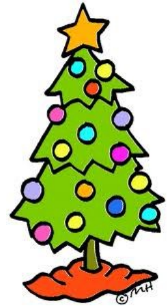
Christmas Tree Blessing

Holy Creator of Trees, bless with your abundant grace this our Christmas tree as a symbol of joy. May its evergreen branches be a sign of your never-fading promises. May its colorful lights and ornaments call us to decorate with love our home and our world. May the gifts that surround this tree be symbols of the gifts we have received from the Tree of Christ's Cross. Holy Christmas tree within our home, may Joy and Peace come and nest in your branches and in our hearts. Amen. - Author Unkown